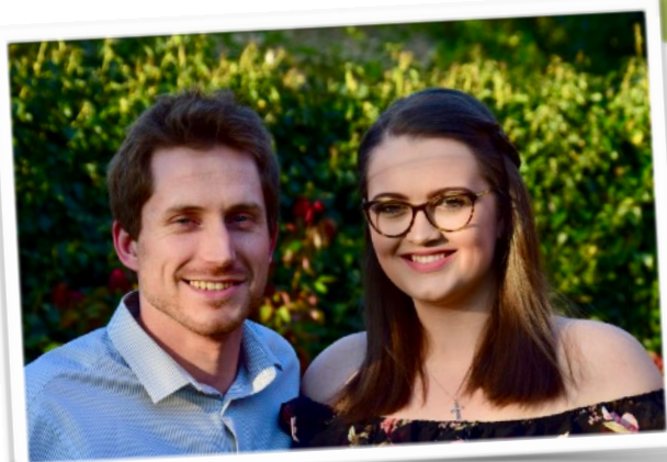
The engagement picture