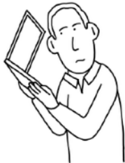
PROBLEMS WITH THE SOUND