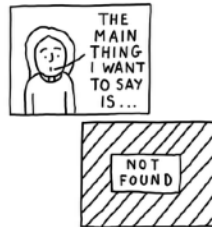
INTERNET BREAKS AT CRUCIAL MOMENT