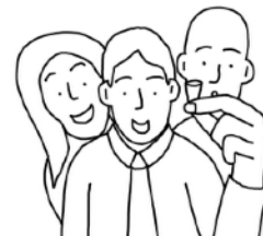
INVASION BY ROWDY GROUP OF METHODISTS