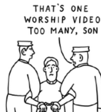
LIVE ARREST OWING TO IGNORING COPYRIGHT