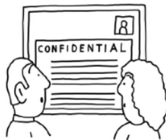
ACCIDENTAL SCREEN-SHARING OF PASTORALLY-SENSITIVE INFORMATION