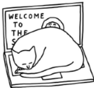
ANIMALS RUNNING AMOK