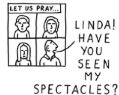
FAILING TO MUTE THE CONGREGATION